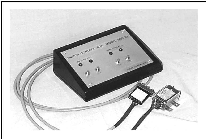
Figure 1 : RF Switch Control Box, model SCB-2D

Focus Microwaves introduces a new RF-switch Control Box for On-Wafer Load Pull and Noise Measurements . A new Tuner Controller Interface Card eliminates the need for an additional analog card, model AB08R, which was required up to now for dedicated control of the RF switch-relays. This new Tuner Control Card with Integrated Switch Control Option can be connected directly to the new Switch Control Box, model SCB-2D . The SCB-2D can remotely control up to two RF-switch relays with no need for an external DC power supply .