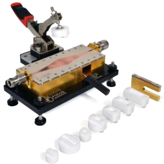
Power Test Jig

Since load pull is a lengthy test procedure, on the same device, we opted for a manual, instead of an automatic probe station (LPPS).