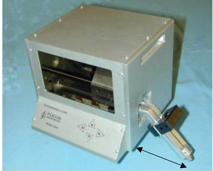
Figure 1: 50GHz on-wafer tuner

The extended 45° bend airline is directly attachable to the probe for minimum possible insertion loss and maximum tuning range.